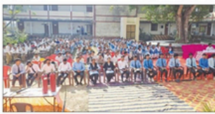
कॅरियर गाइडेंस मेले में उद्घाटित छात्र छात्राएं।

कार्यक्रम में भाजपाध्यक्ष द्वारा पुलिस सेवा में भर्तिल होने के लिए आवश्यक लक्ष्यों को विस्तार पूर्वक बताया गया। वहीं राजकीय पॉलिटेक्निक के प्रचार्य ने पॉलिटेक्निक में प्रवेश व उसके विभिन्न कॅरियर को जानकारी